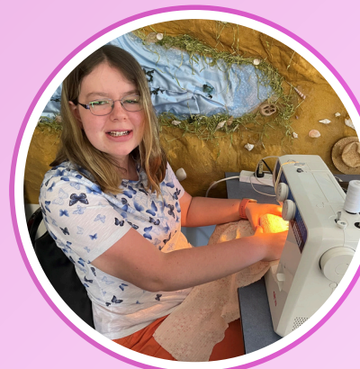
Sewing and Jewellery Making