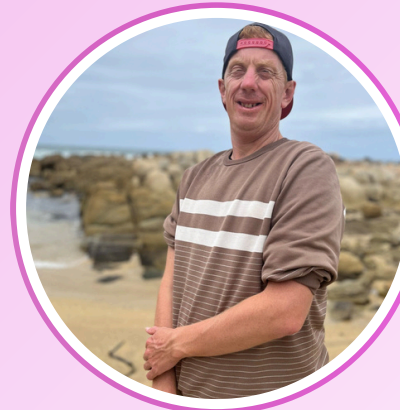
Out & About