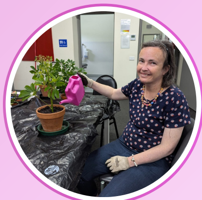
In the Garden