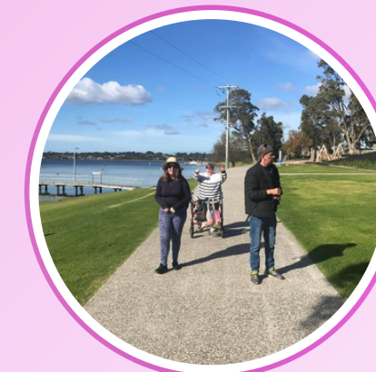
Walking & Swimming